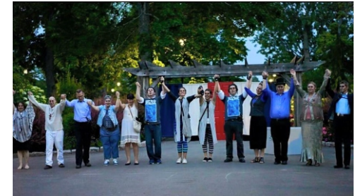
Comedy of Errors Shakespeare in the Park 2016

To learn more or how to get involved our upcoming auditions and planned productions for the season connect with us :