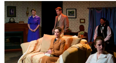
Agatha Christie's The Mousetrap 2014