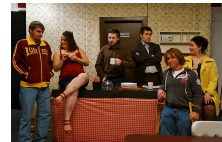
Producing original works: Last Chance 2014